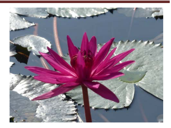
Lilies at Angkor Wat