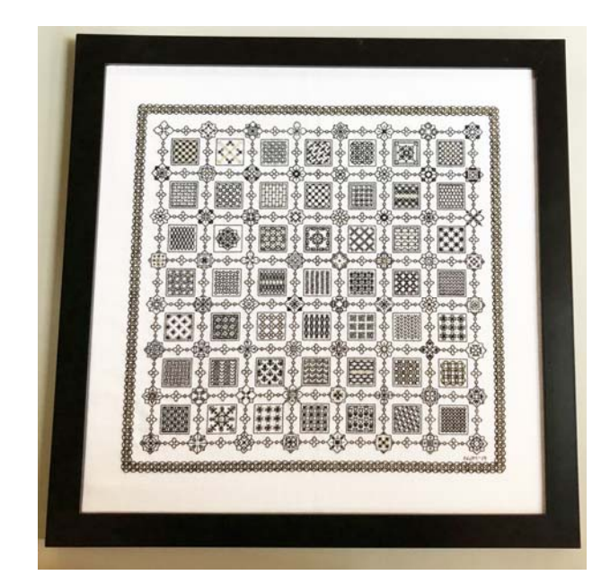
12 Blackwork Journey ©