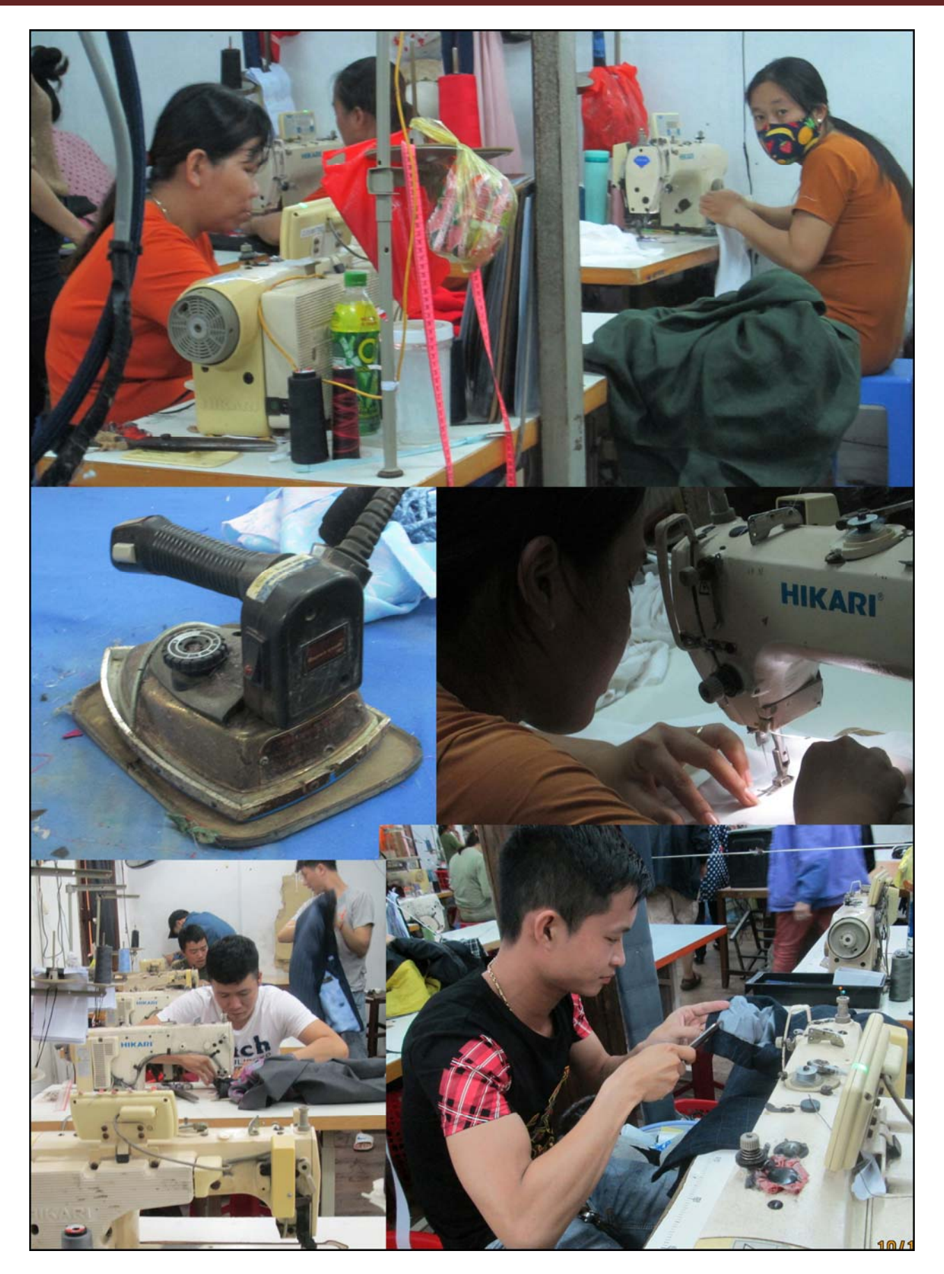
Instant clothing for the tourist!